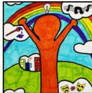
Creating, imagining and innovating