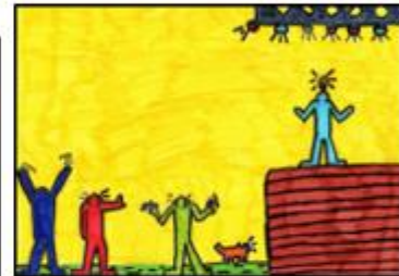
Thinking and Communicating with Clarity and Precision