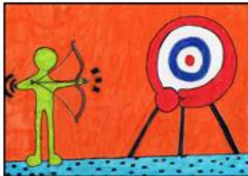
Striving for Accuracy