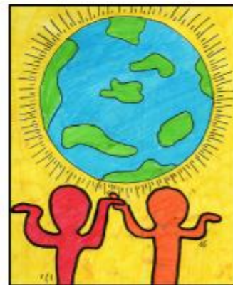
Applying Past Knowledge to New Situations