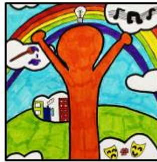
Creating, imagining and innovating