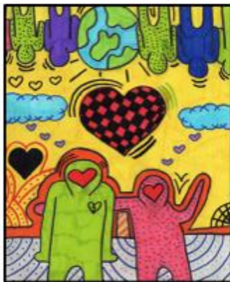
Listening with Understanding and Empathy