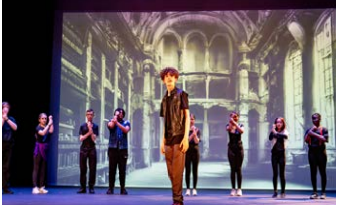
Marlowe Theatre